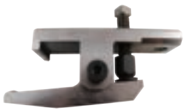
P/N 785-000-0070 Bead Breaker, Assy, Sur-Loc