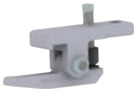
P/N 785-000-0072 Bead Breaker, Assy, Bead Band